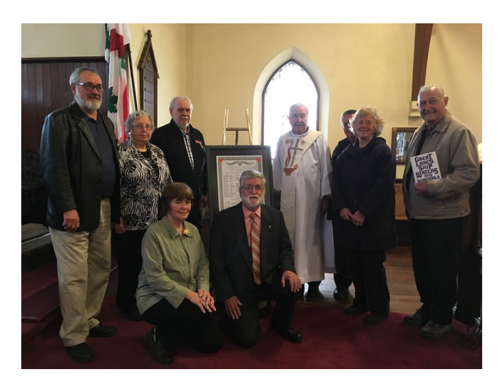
Scroll with the names of the 39 who died on the night of May 5/6 1850 when the Despatch struck the Commerce. All are buried in Christ Church Cemetery

On Sunday May 6, 2018 we attended a service at Christ Church in Port Maitland where we presented the congregation with a memorial scroll naming the thirty-nine souls who lost their lives when the ship Despatch struck the Commerce . You can read the full story in our <u>Grand Despatch</u> of Spring 2018.