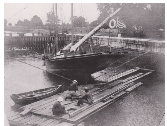
West Wind being repaired in Port Maitland Lock in 1901

We began our venture at the former Port Maitland Lock where for a number of years we maintained the property until the Canadian Pacific Railway raised our annual rent beyond our means.