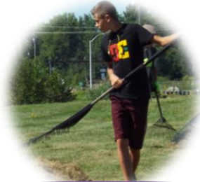
?? rakes at the lock