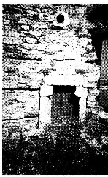
Ruins of Mohawk Island Lighthouse as it looks today.

Presently, our lonely lighthouse stands as a reminder of an age of great growth. It guided vessels of sail, then steam-driven paddle wheelers and later diesel powered propellers. It has out lived the Fenian raids, the American Civil War and two world wars. For a decade the Mohawk Lighthouse Preservation Association has vowed to bring life back to this once vital aid to mariners. The shallows around the island are as dangerous to the weekend boater today as they were danger to large ships with minimal navigational aids of 150 years ago.