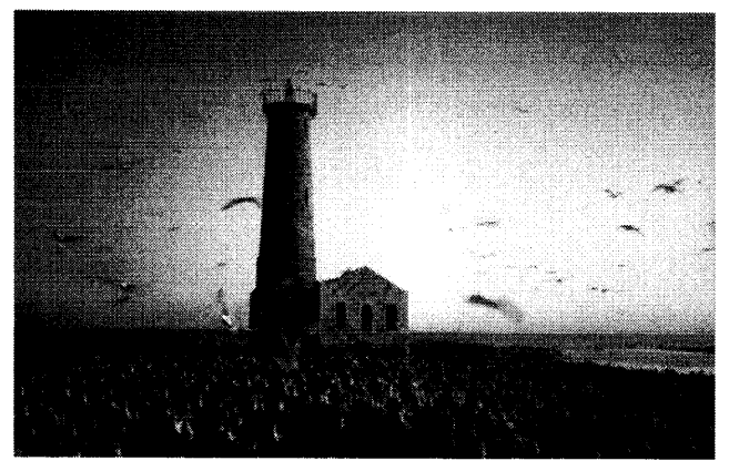
Ruins of Mohawk Island Lighthouse as it looks today.

Presently, our lonely lighthouse stands as a reminder of an age of great growth. It guided vessels of sail, then steam-driven paddle wheelers and later diesel powered propellers. It has out lived the Fenian raids, the American Civil War and two world wars. For a decade the Mohawk Lighthouse Preservation Association has vowed to bring life back to this once vital aid to mariners. The shallows around the island are as dangerous to the weekend boater today as they were danger to large ships with minimal navigational aids of 150 years ago.