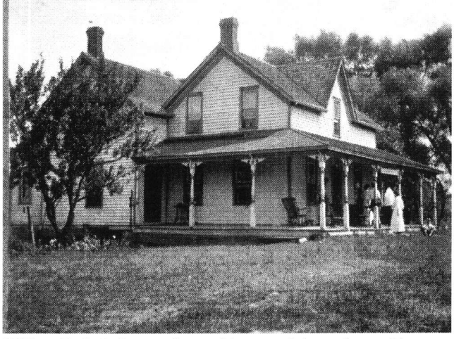
Willow Dale in better days with verandah on three sides.

opposite side of the room and extended the pipe horizontally just below the ceiling. This provided more heat, but looked terrible and could be very dirty. The pipe extended up through the bedrooms above and many a close call was had when we set our clothes or cold socks too close to the pipes to warm them, only to find them smelling, holey and burnt.