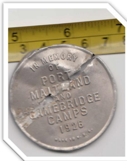
Oldtimers - Any ideas?