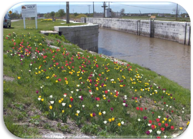
The Port Maitland Lock after being cleaned up by citizen group.