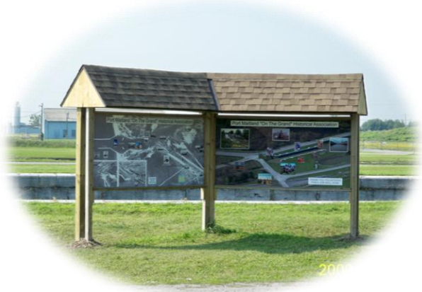
Information Kiosk was placed at Port Maitland lock. It is now removed awaiting the County's response and hoped for support.

has not been great for some time which leads me to the conclusion that I am just not willing to continue the struggle with the County. This may be a struggle that the County wishes it had avoided in the first place.