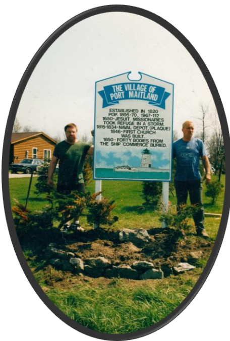
Sign at 4 corners being placed in position in June 1996 Photo source unknown

as the four corners (Kings Row and Airport Rd) is a sign stating that Port Maitland was established in 1820. It has been long agreed by the locals this date was accurate and until it was put to the test no one has ever expressed questions about it. It was mentioned in the spring 2013 issue of The Grand Dispatch that we were unable to find any reference to the incorporation of Port Maitland at any of the normal depositories for this type of information. This matter will be pursued further.