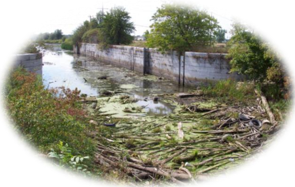
The Port Maitland Lock before being cleaned up by citizen group.

County of Haldimand shows little interest in Port Maitland Lock! When will mission be completed?