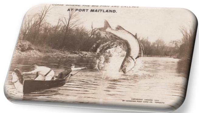
Even the old Postcards simply say Port Maitland. I would like to know where this was taken!

The year 1828, is the first "text" reference to the name "Port Maitland" that will be used in this article. Since the Feeder Canal is on the east side of the Grand River, it seem likely that the east side