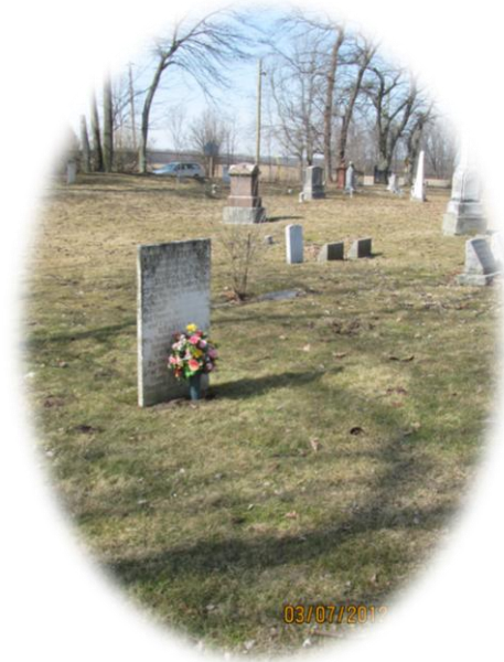
Current memorial stone for the Reserve Battalion, Royal Welch Fusiliers in Christ Church Port Maitland

While you are there, take some time to look at the other stones and discover the rich history this little cemetery on the lake holds for the former townships of Sherbrooke and Dunn.