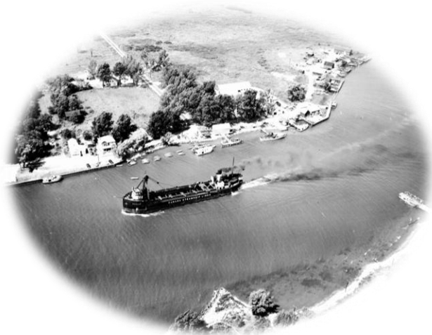
Coal Carrier Coal Haven leaving Port Maitland circa 1932