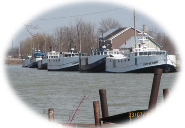
Feeder Canal, winter of 2012